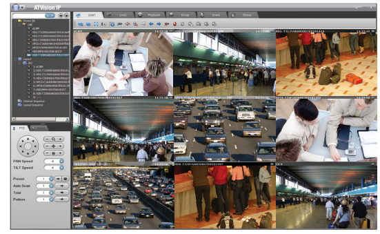
ATVision IP Remote Management Software

Digital Video eSATA External Storage Devices See eSATA External Storage Category