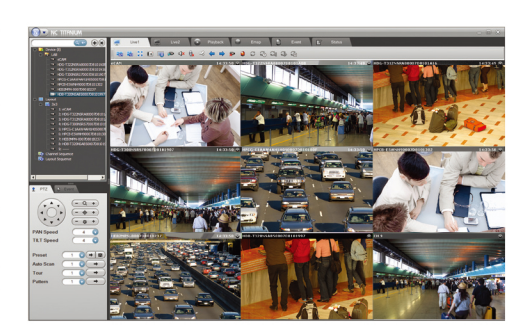
ATVision IP Remote Management Software