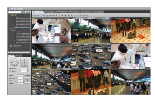
ATVision IP Remote Management Software