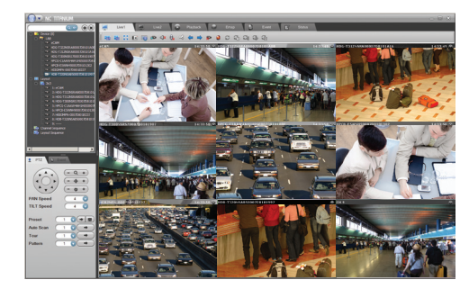
ATVision IP Remote Management Software