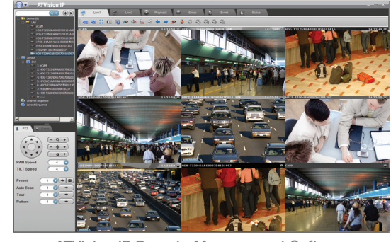
ATVision IP Remote Management Software