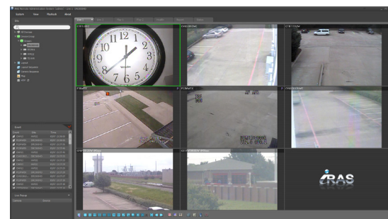
iRAS Remote Management Software