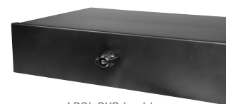
LB3L DVR Lockbox

LB3L DVR Lockbox, Large eSATA Storage see eSATA External Storage category